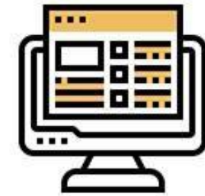
APPLICATION BASED ASSIGNMENTS