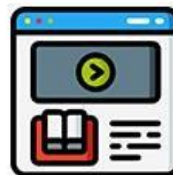
COURSE OF ACTION