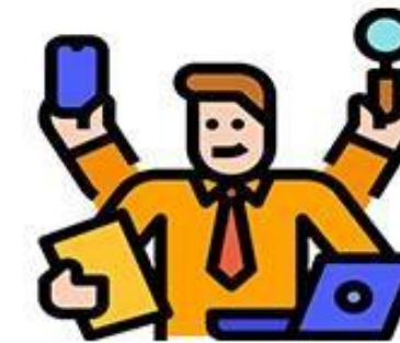
DEDICATED COURSE COORDINATORS