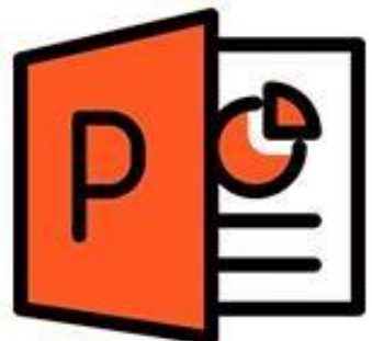
POWER POINTMENT PRESENTATIONS