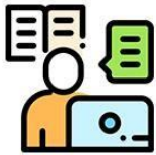
ONLINE READING MATERIAL