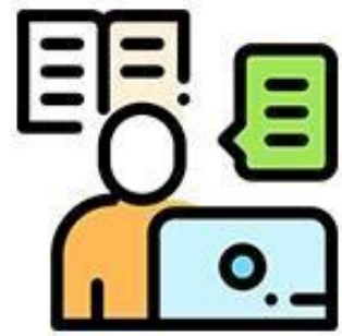
ONLINE READING MATERIAL